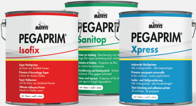
Pegaprim® Xpress - Pegaprim® Isofix - Pegaprim® Sanitop

For a great paint job... Prime with... PEGAPRIM®!